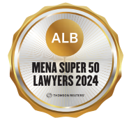
Thomson Reuters ALB MENA Super 50 Lawyers

“With an incredible amount of knowledge and a wealth of expertise about local issues, AMERELLER is the go-to firm in the Middle East.”