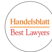
Handelsblatt Best Lawyers